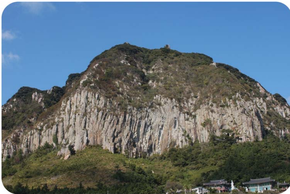
Mt. Sambang, Jeju

The 15 th International Symposium of Geospatial Information Science and Urban Planning